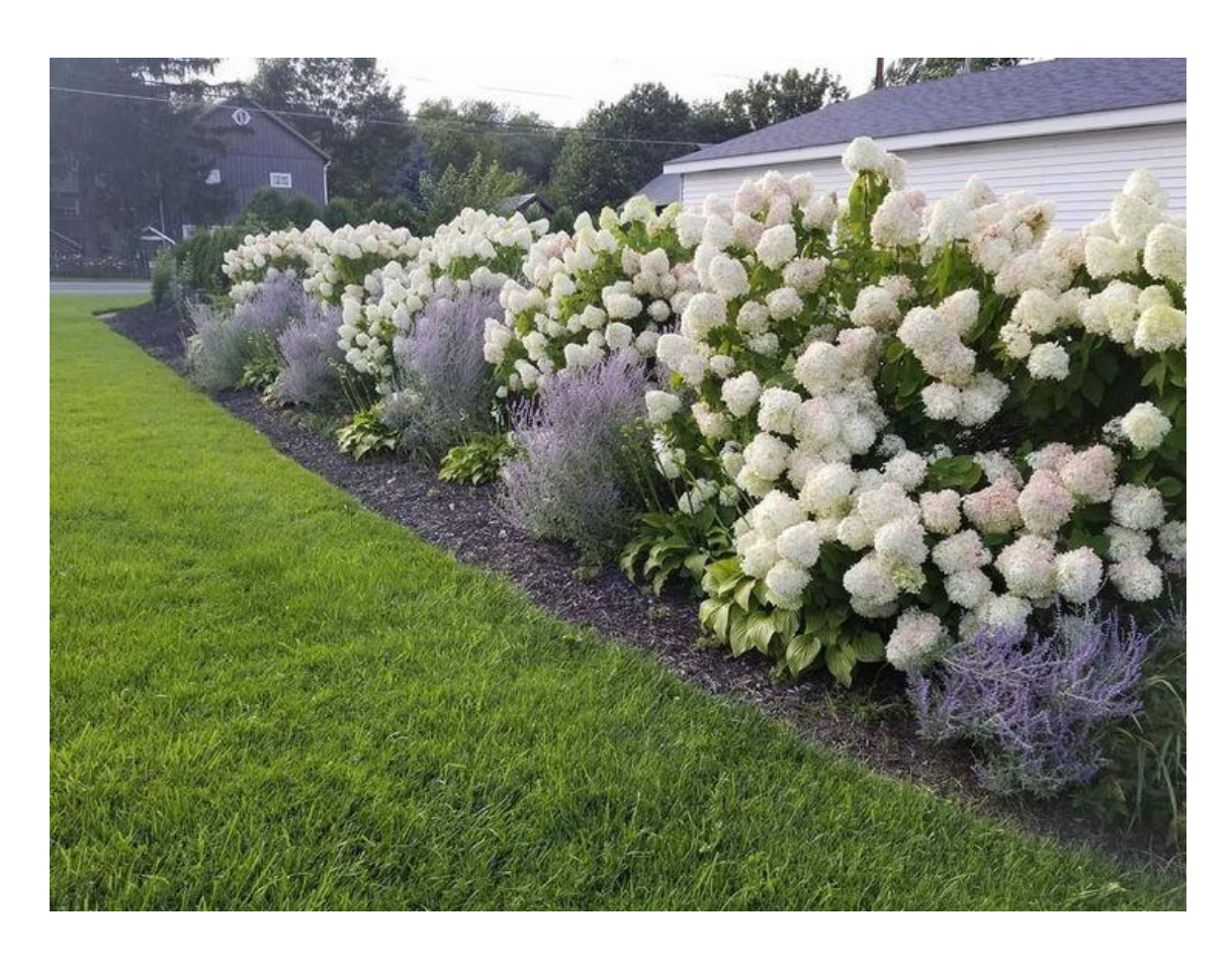
Depot Drive Islands - Hydrangea & Lavender Salvia